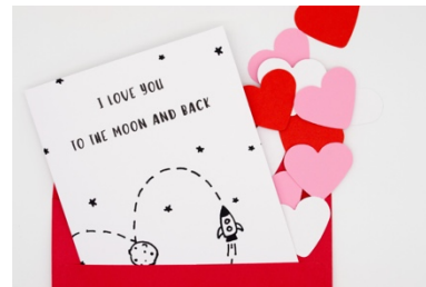
Send Someone a Nice Card