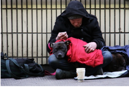
Helping the Homeless