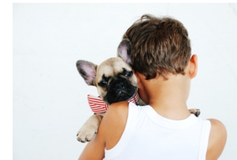
Be Kind to Animals