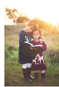
Read to a Friend