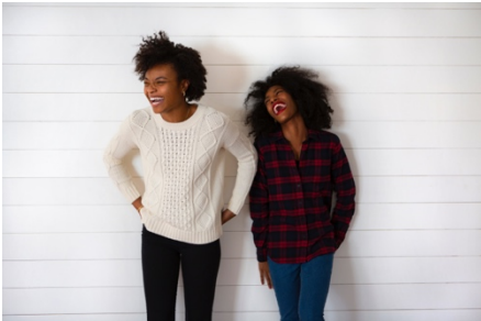
Make Someone Laugh