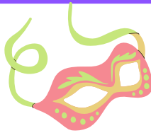
Someone wearing a mask