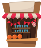
A Purim Carnival in it