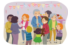
Celebrating with friends or family